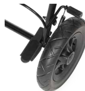
Tip assist (shown on size 2)

You will find the total overview of all rehab accessories on our website: www.thomashilfen.us