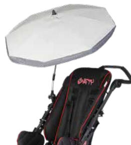
Umbrella (shown on size 1)