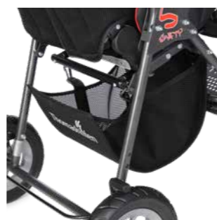
Basket (shown on size 1)