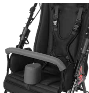
Butterfly chest harness (flexible), abduction block and grip rail (shown on size 2)