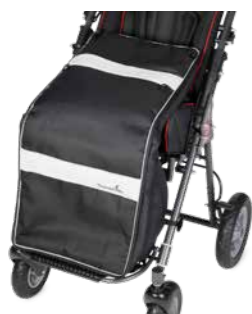
Sleeping bag, padded (summer) or woven fur (winter) (shown on size 1)