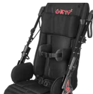
Head pillow, lateral trunk support with chest belt and 2-point pelvic harness (shown on size 2)