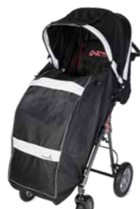
Sun and rain cover with leg blanket (shown on size 1)