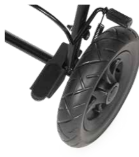
Tip assist (shown on size 2)

You will find the total overview of all rehab accessories on our website: www.thomashilfen.us