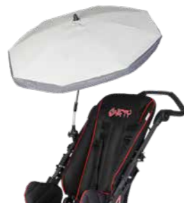
Umbrella (shown on size 1)