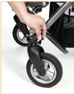
swivel wheels with swivel lock

Strollers with swivel wheels are a lot more versatile and easier to steer in turns. On the other hand, they have the disadvantage that even slightly uneven country roads make strolling uncomfortable.