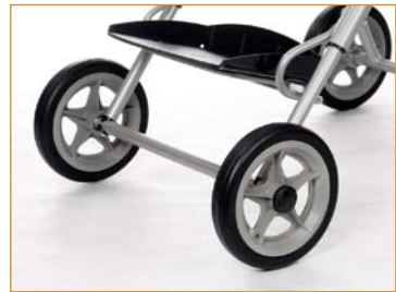
rigid front wheels

Big wheels are often rigid and do not swivel. This means, in each turn the stroller must be lifted slightly, in the front. This may not be a problem with small, light weight children, since you do not need to apply that much force. But rehab strollers are often used for several years. So, bear in mind that the children typically gain weight over time.